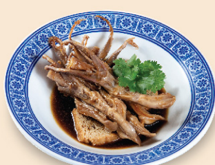
65 麻辣鴨舌 Marinated Duck Tongue in Chilli Sauce $68