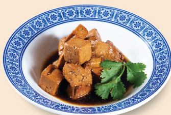
67 麻辣豆干 Marinated Tofu $48