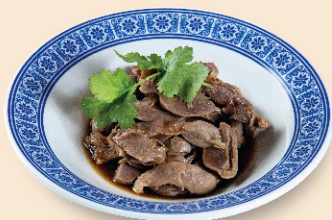
58 鴨腎 Marinated Duck Gizzard $98