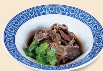
63 雞腎 Marinated Chicken Gizzard $68