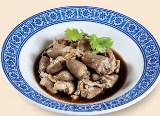
62 雞心 Marinated Chicken Heart $68