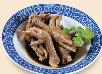
64 雞腳 Marinated Chicken Feet $68