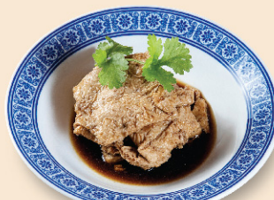
68 豆皮 Marinated Beancurd $48