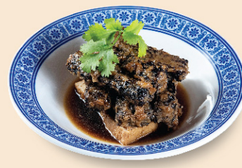
66 米血 Marinated Pig Blood Cake $48