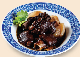
61 傳統滷豬腳蘿蔔 Marinated Pork Hocks with Turnip $78