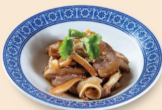
59 豬耳 Marinated Pork Ear $78