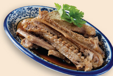
60 鴨翅 Marinated Duck Wings $78