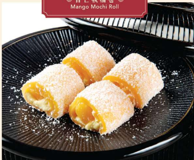
🍃 香芒軟糯卷 🍃 Mango Mochi Roll