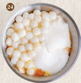
24 薑汁豆花 $18 小丸子、薑汁、豆花 Mini Glutinous Rice Ball, Ginger Juice, Tofu Pudding