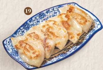
19 新鮮豚肉鍋貼 (5件) $42 Taiwanese Fried Pork Dumpling (5 pcs)