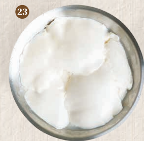
23 原味豆花 $18 Original Tofu Pudding