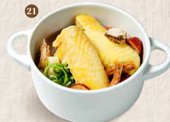
21 藥膳雞翼 $42 Chinese Herbal Chicken Wing with Soup