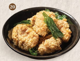
20 鹽酥雞 $42 Taiwanese Fried Chicken