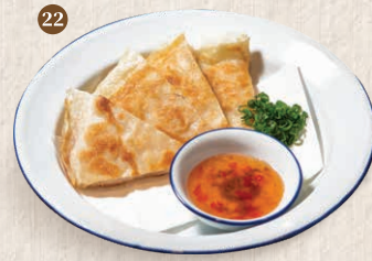
22 蔥肉蝦餅 $42 Fried Shrimp Pancake with Scallion