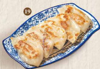
19 新鮮豚肉鍋貼 (5件) $42