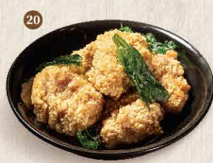
20 鹽酥雞 $42