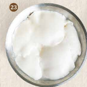
23 原味豆花 $18