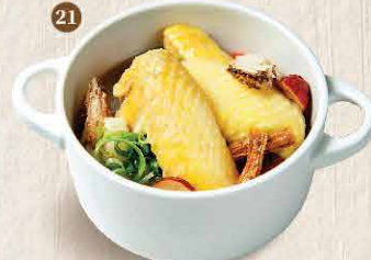
21 藥膳雞翼 $42