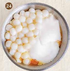
24 薑汁豆花 $18

小丸子、薑汁、豆花 Mini Glutinous Rice Ball, Ginger Juice, Tofu Pudding