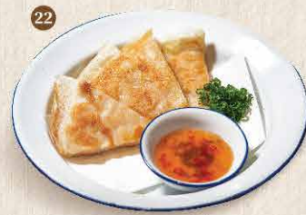
22 蔥肉蝦餅 $42